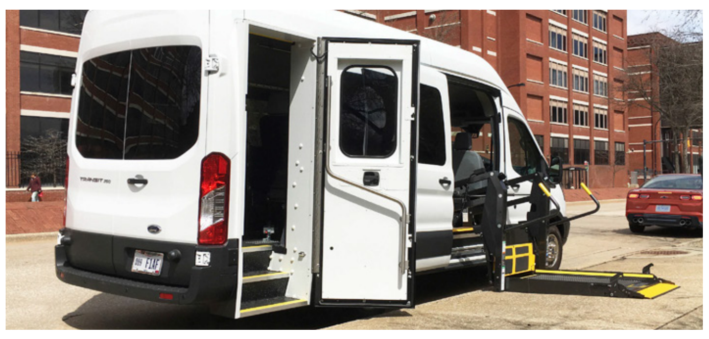
CurbSmart Ford Transit with patent pending curb-side walk-in door and power wheelchair lift provides safe, easy access to the vehicle for all types of passengers.