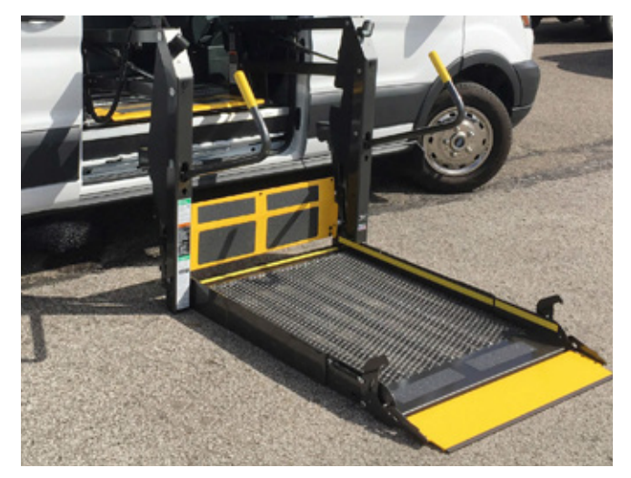
Heavy-duty commercial wheelchair lift with 800 lb. weight capacity.