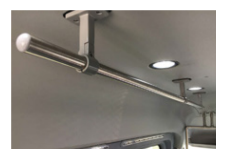
Ceiling mounted grab bar and overhead lighting.