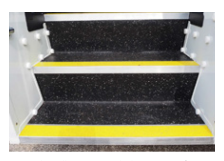
27" wide walk-in steps with slip-resistant flooring.