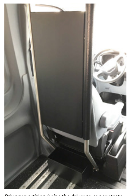
Privacy partition helps the driver to concentrate on the road and their driving.