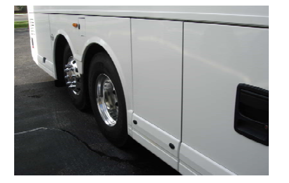
Manual Battery Disconnect