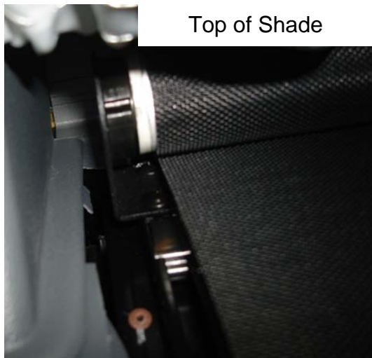
Top of Shade

COACH MODEL : T2140, T2145, C2045 DATE : 03/28/2011 SUBJECT : How to reinstall and wind passenger shades