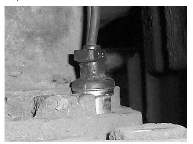
Figure 2 (below): Stepped sensor VH 10796792 won't fit Dana drive axle 826000. Shoulder prevents it from being pushed home fully.

Figure 1 (left): Physical differences between old ABS/ASR sensor VH 10692775 (1) and the new VH 10796792 (2)