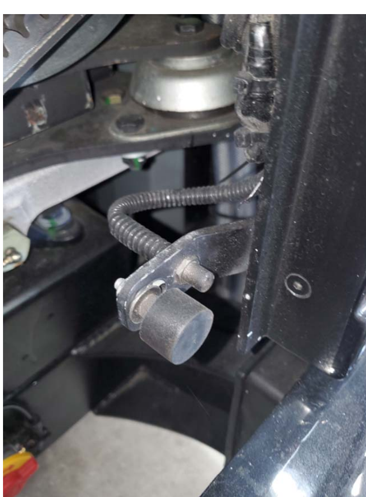
Right side sensor shown above, left side similar.