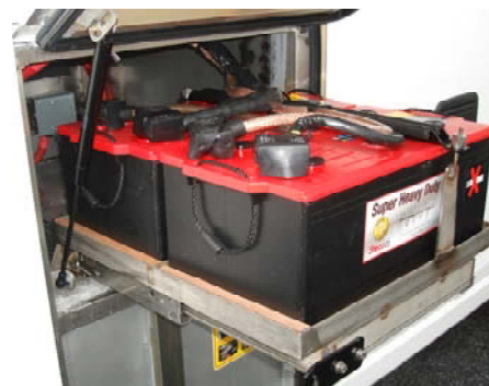
Batteries on slide tray