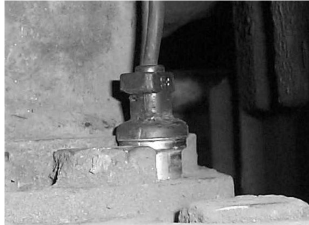
Figure 2 (below): Stepped sensor VH 10796792 won't fit Dana drive axle 826000. Shoulder prevents it from being pushed home fully.