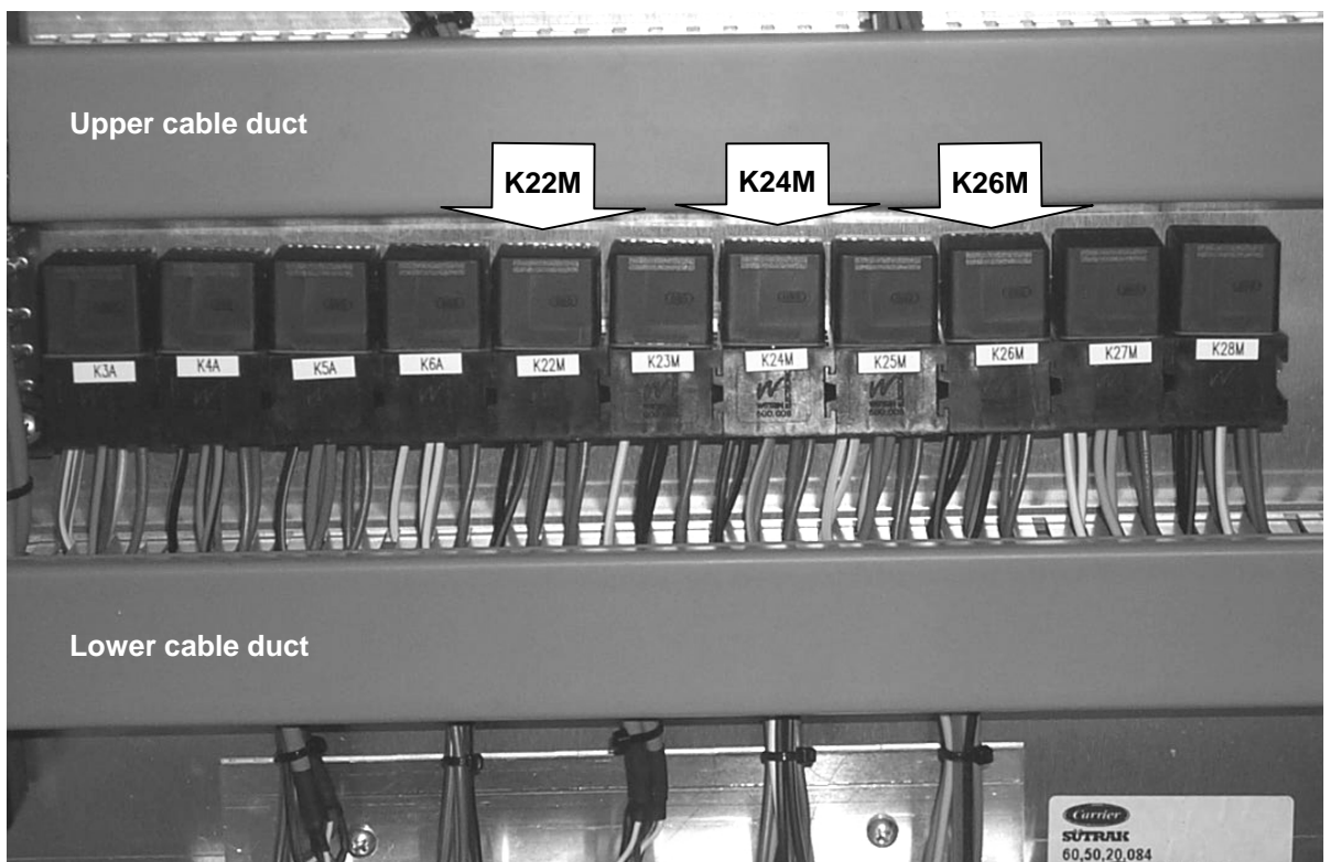
Figure 3: Relays upper and lower cable duct