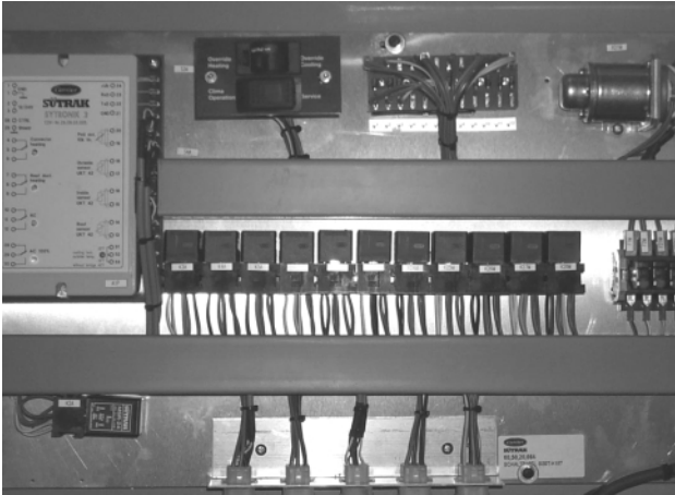
Figure 2: Carrier/Sûtrak HVAC switchboard