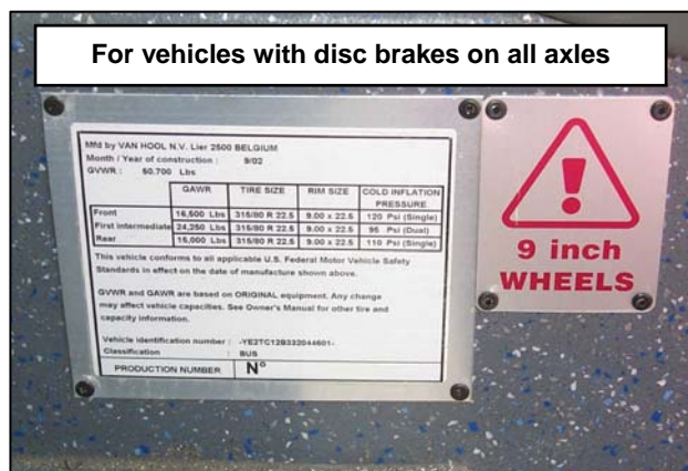
Figure 3: VIN plate with new axle load ratings, and 9 inch wheel warning plate VH 10774277